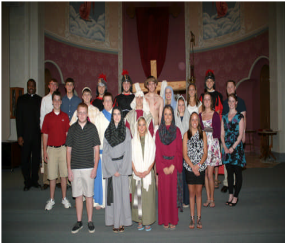
SPP Youth Ministry Living Stations of the Cross