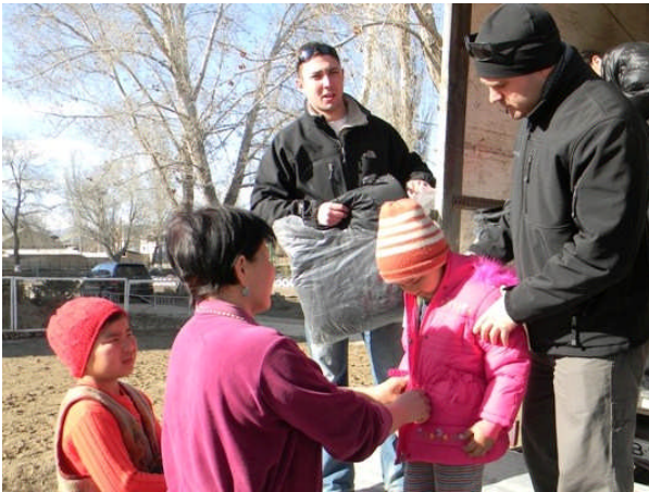
SPP donated clothing arrives in Kyrgyzstan!