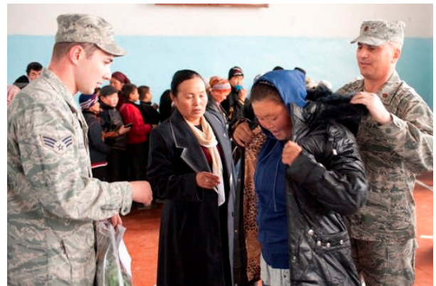
USAF airmen distributing donated clothing from SPP