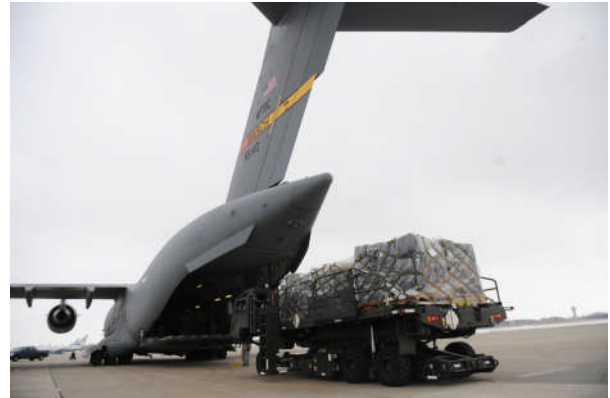
On its way to Kyrgyzstan - USAF Loads Clothing Collected by SS Peter & Paul PSR!

More than 6,500 pounds of humanitarian goods were loaded onto a C-17 Globemaster III. Over half of the items were donated and collected by the SS Peter & Paul PSR program in the fall! Included in the shipment were 3 pallets of 11 skids piled with donated blankets, winter coats, gloves, clothing, toys, and shoes.